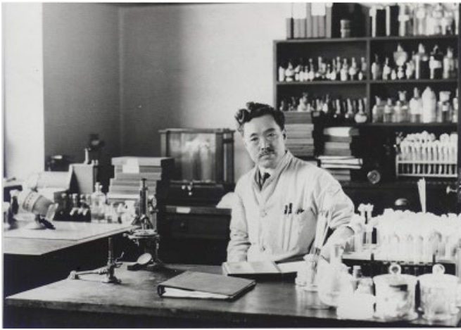
Dr. Hideyo Noguchi in his lab at the Rockefeller Institute for Medical Research

The Fifth Hideyo Noguchi Africa Prize nominations are open from March 27, 2024. Information on the Fifth Hideyo Noguchi Africa Prize nominations including the Nomination Guidelines and the Nomination Form is available on the website shown below. The nomination deadline is September 20, 2024.