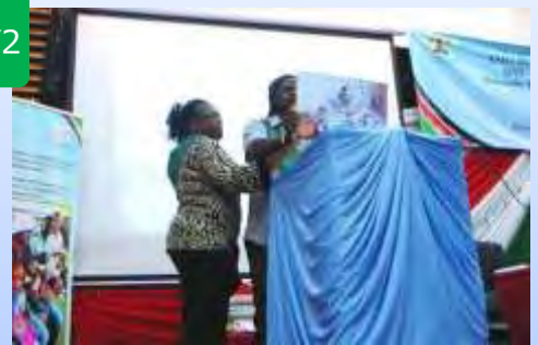
Approximately 300 people participated from 25 countries in total (14 countries in Africa and 11 countries other than in Africa)