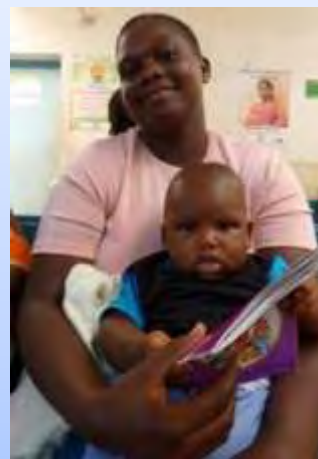
Kenyan mother and her baby with a MCH Handbook