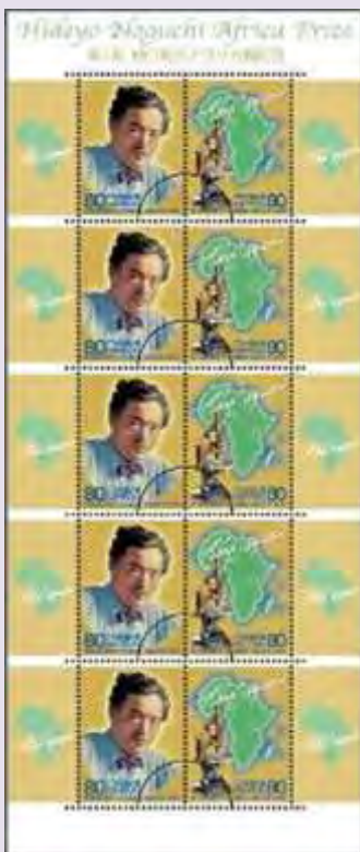
The special postage stamps of the First Hideyo Noguchi Africa Prize in 2008

Commemorating Dr. Hideyo Noguchi, who was born in Fukushima and made achievements worldwide, the memorial stamp of the second Hideyo Noguchi Africa Prize will be released (scheduled to be on sale on May 31, 2013).