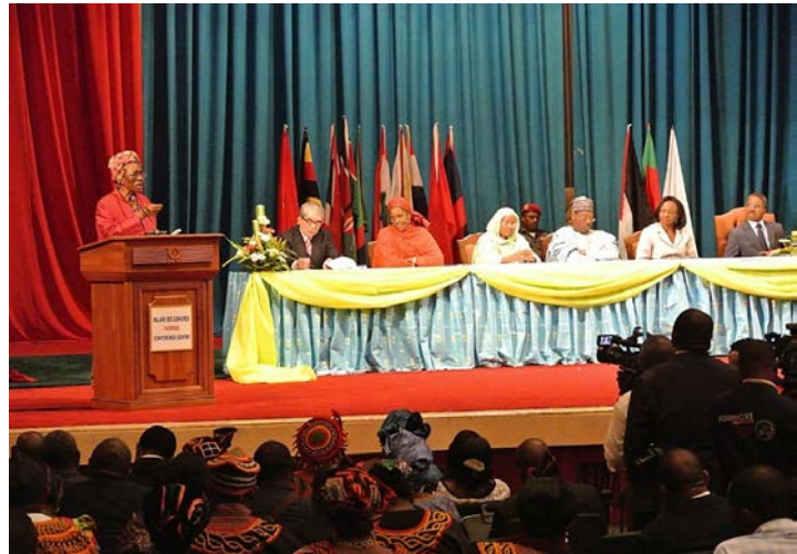
Prof. Were speaks at the conference.

(i) the prize recognizes the need for action to tackle and solve the problems facing Africa through improvements in health and medicine, (ii) as its objective states, the prize aims to contribute to the health and welfare not only of the African people, but of all humankind, (iii) the prize is separated into two categories—outstanding achievements in the fields of