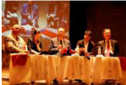
Future Design 2050