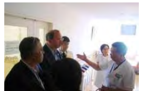
At Aizu Medical Center