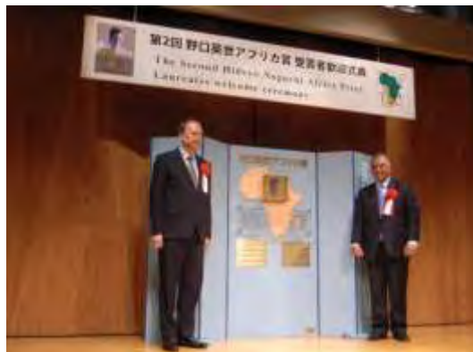
The monument of the Hideyo Noguchi Africa Prize