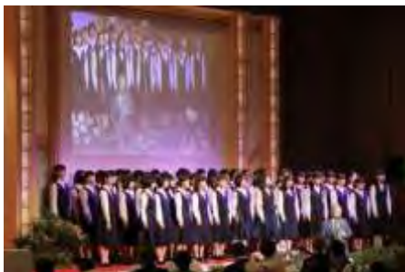
The Choral of Fukushima regional prefectural Asaka Reimei high school and Mr. Sadao WATANABE

From Fukushima, Dr. Noguchi's hometown, the Choral of Fukushima prefectural Asaka Reimei high school and Komatsu shishi preservation group came to perform at the ceremony. Mr. Sadao WATANABE, a Jazz saxophone player performed with Asaka Reimei high school.