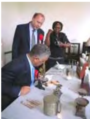
The Former Bacterial Laboratory

After visiting the laboratory, the welcome ceremony was held by Yokohama City. The laureates put their name plates on the monument of the Hideyo Noguchi Africa Prize. Yokohama city carries out the educational project called "One School- One Country". Elementally schools and junior high schools students in the city study about countries of Africa. At the ceremony, the elementally schools students who studied the Republic of Ghana and the Republic of Uganda gave presentations and welcomed the laureates.