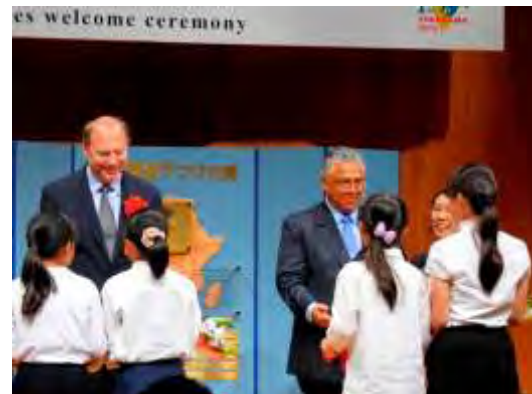
Presentation bouquets of flowers by children of Yokohama City