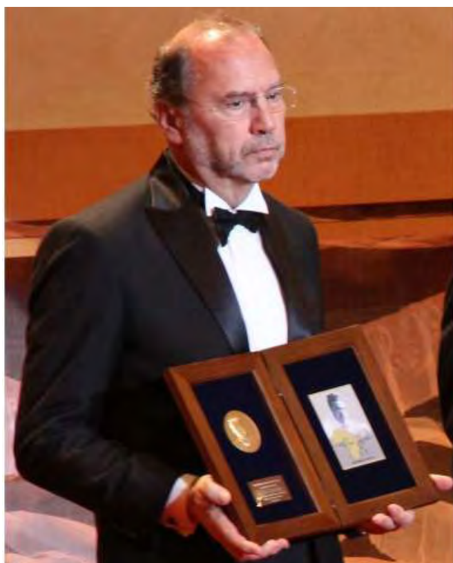
Dr. Peter Piot