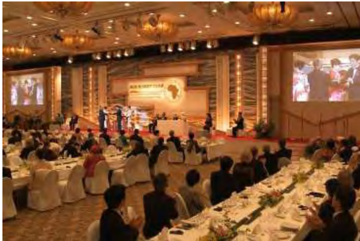
The Banquet Hall