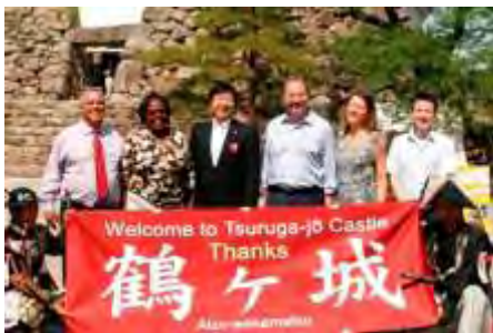
At the Tsuruga Castle