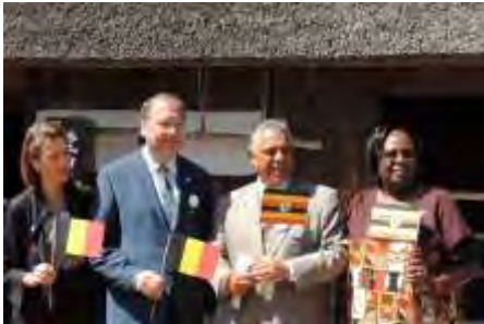
The Hideyo Noguchi Memorial Hall