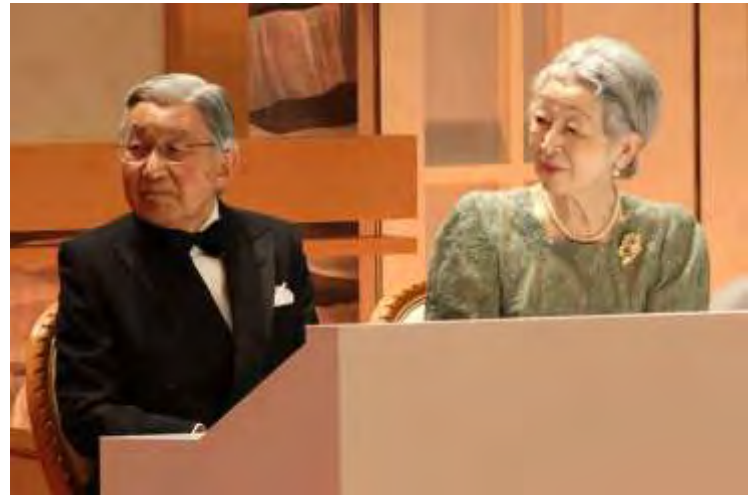
Their Majesties the Emperor and the Empress