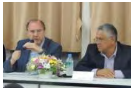
Exchange meeting at Okuma junior high school