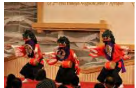
Komatsu shishi preservation group