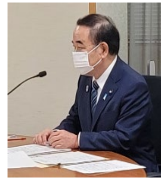
The Prime Minister, Chief Cabinet Secretary, The Minister for Loneliness and Isolation at that time attended.