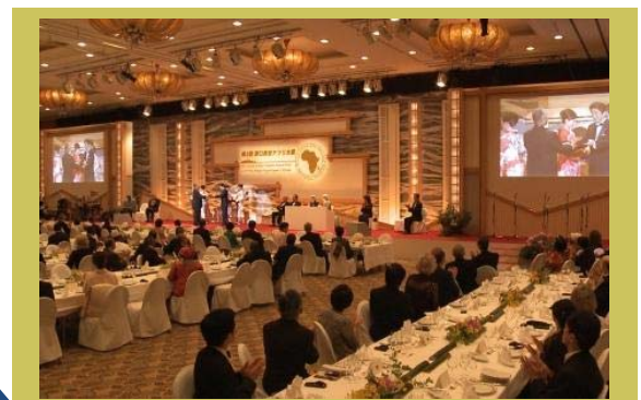
The awarding ceremony and memorial banquet