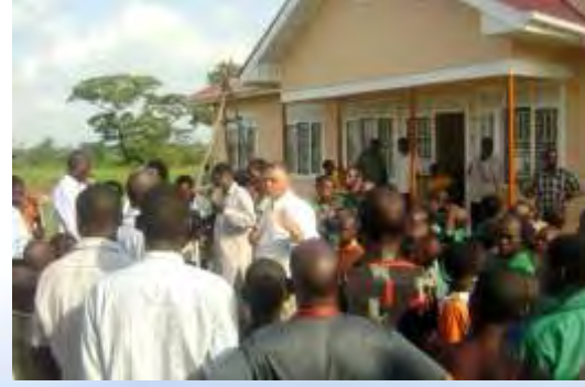
Launching a new HIV center in a rural district

From the Birthplace of Dr. Hideyo Noguchi