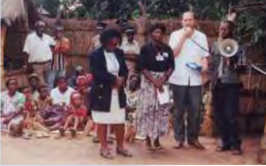
Addressing Community in Livingston, Zambia.