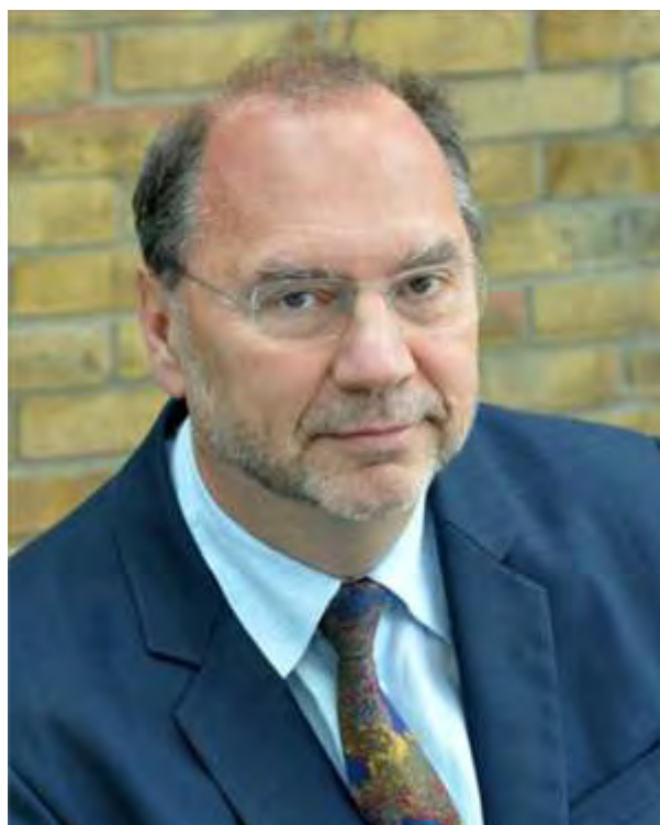
Dr. Peter Piot, Belgium Medical Research Category Director and Professor of Global Health, London School of Hygiene & Tropical Medicine