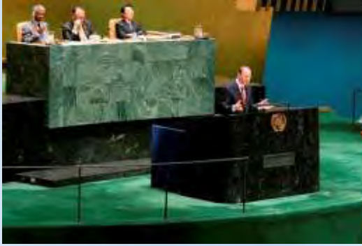
Addressing UN General Assembly in 2005