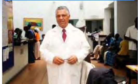
HIV clinic of Infectious Diseases Institute of Makerere University