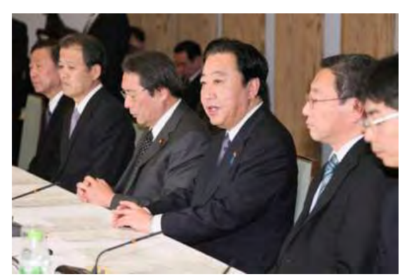
Prime Minister Yoshihiko NODA attended the committee meeting

Hideyo Noguchi Africa Prize Committee was held at the Prime Minister's official residence on February 20, 2012.