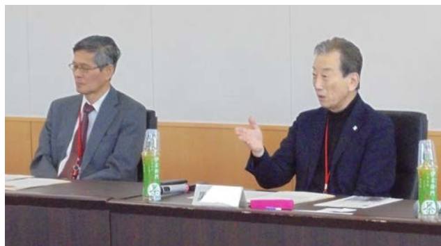
The kick-off meeting of the Hideyo Noguchi Africa Prize Committee underway