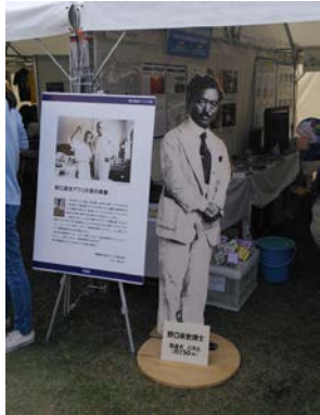
Life-size panel of Hideyo Noguchi

To publicize the Hideyo Noguchi Africa Prize, we participated in the Global Festa Japan 2017, held in Odaiba, Tokyo on the weekend of