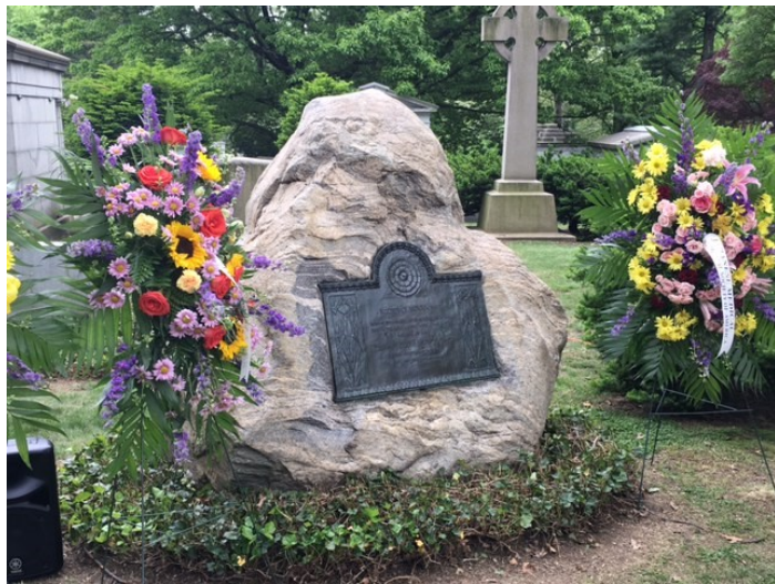
Hideyo Noguchi's grave in Woodlawn Cemetery