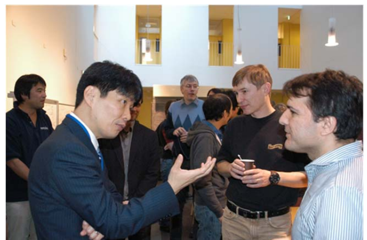
Left : The 10th Science and Technology Ministers' Roundtable Meeting chaired by Minister Yamamoto Right : Interacting with young foreign researchers

For details → Council for Science and Technology Policy: http://www8.cao.go.jp/cstp/english/index.html , Japan Atomic Energy Commission: http://www.aec.go.jp/jicst/NC/eng/index.htm