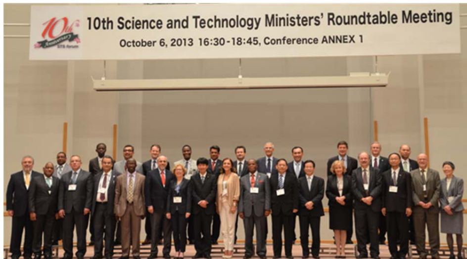
The 10th Science and Technology Ministers' Roundtable Meeting(commemorative photo)