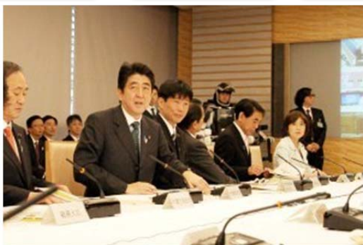
The Prime Minister delivering an address at CSTP plenary session