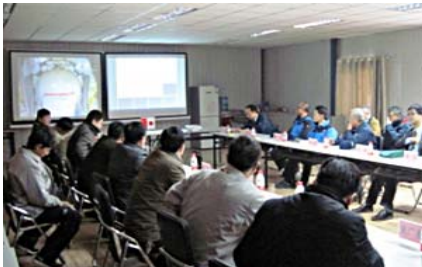
<Officials of Japan and China watch destruction activity in Shijiazhuang>