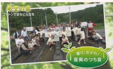
TV Program for Reconstruction Support; Fukushima Television (2013/7/7)