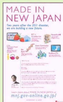
"Financial Times" (2013/3/11)