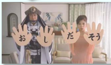
TV Ad Spot; "Consumer Protection" (2013/9)

Using a well-known person suitable for appeal targets