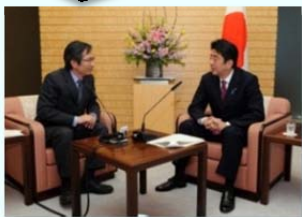
Regular Radio Program (2013/1)

Talking directly to people about important policies