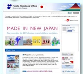
"Public Relations Office" website

Utilizing the website and SNS, based on the spread of IT