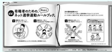
Newspaper Ad under Articles; "Election Campaigning through the Internet" (2013/5)

Timely publicity is important as to system revision