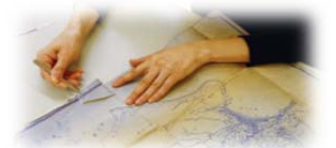
(Conservation of Specified Historical Public Records and Archives)

For details (in Japanese only) → http://www8.cao.go.jp/chosei/koubun/index.html