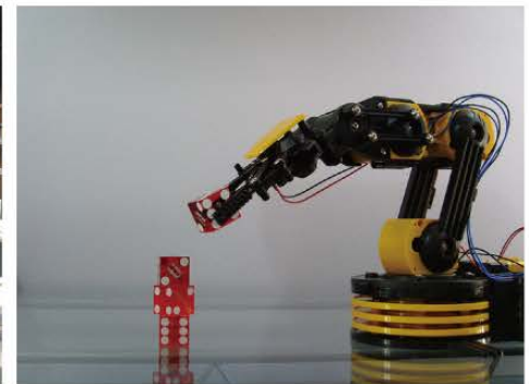
photo by Dan Ruscoe "Robotic Arm Lifting Dice" https://flic.kr/p/deHtEb