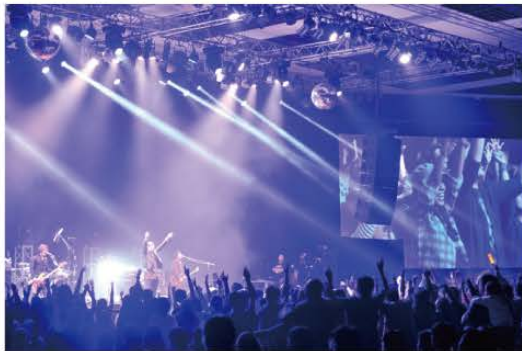
Tokyo Ska Paradise Orchestra at Japan Night in Jakarta @ The Kasablanka, April 4, 2015